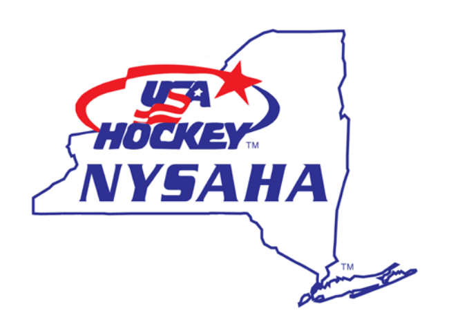
Be sure to visit the NYSAHA website at WWW.NYSAHA.COM